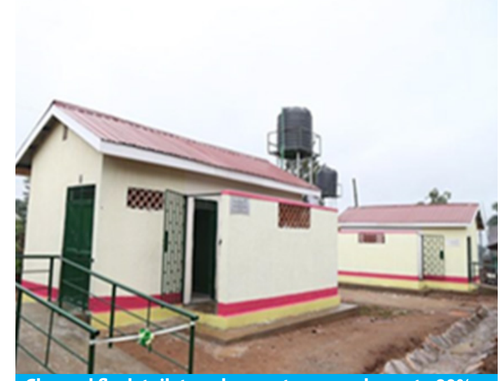
Channel flush toilets reduce water usage by up to 90% and the reservoir can hold about 60 litres of water

He highlighted that the technology has been tried with 8 to 10 stances connected to one channel. Chances are high that at one point such seals will give way and allow foul air into the stances. The best is to vent off the odor from the channel.